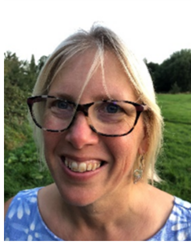
Fiona Moss National RE Adviser RE Today