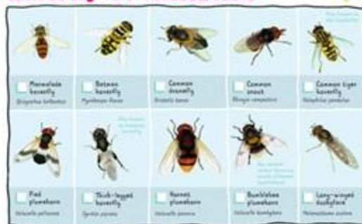
Pictured: The many types of hoverflies.

of information relating to creatures both great and small, plants and all things wildlife and have recently created a helpful guide to help identify the different types of hoverfly. 'Use this handy ID guide to spot species like the marmalade hoverfly & bumblebee plumehorn', the charity shared on their social media.