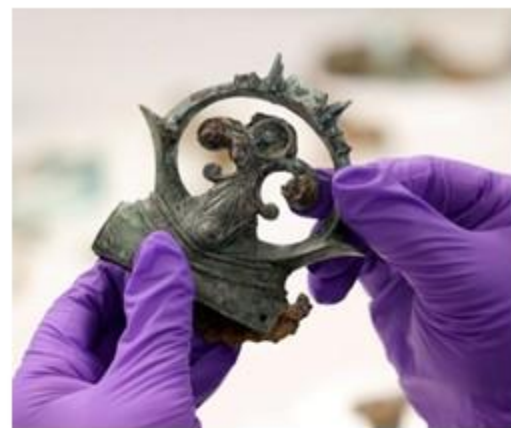
Pictured: An Iron Age artefact discovered in the Melsonby Hoard.