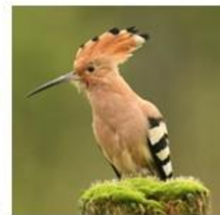
Pictured: A hoopoe.

The Royal Society for the Protection of Birds (RSPB) has excitedly reported an increase in sightings of a very special type of bird – the Hoopoe, in the southwest of England. The Hoopoe is a medium-sized bird, about 25-32cm from its beak to its tail, so is about the same size as a small pigeon. They also have a very interesting crest (the feathered part on the top of their head), and a long, curved beak, which helps them to catch the insects they like to eat. This beautiful pinkish-brown bird, with black