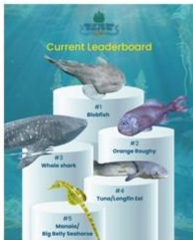
Pictured: The fish leader board during the competition.

Unfortunately, when people remove the blobfish from their natural habitat, the water pressure isn't high enough for their gelatinous body to keep their shape. This means they turn into what has been described as 'a messy blob of