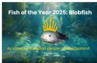
Pictured: Fish of the Year 2025 – the blobfish.