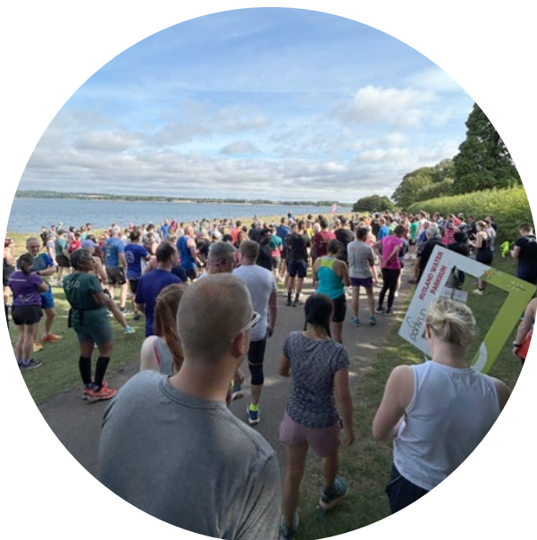
Nearby Rutland Water and its weekly Park Run