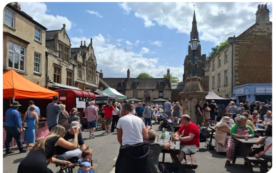
Uppingham's Summer Feast Day