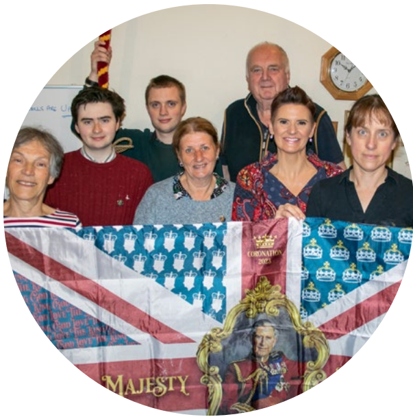
Bell Ringers celebrate King Charles' Coronation