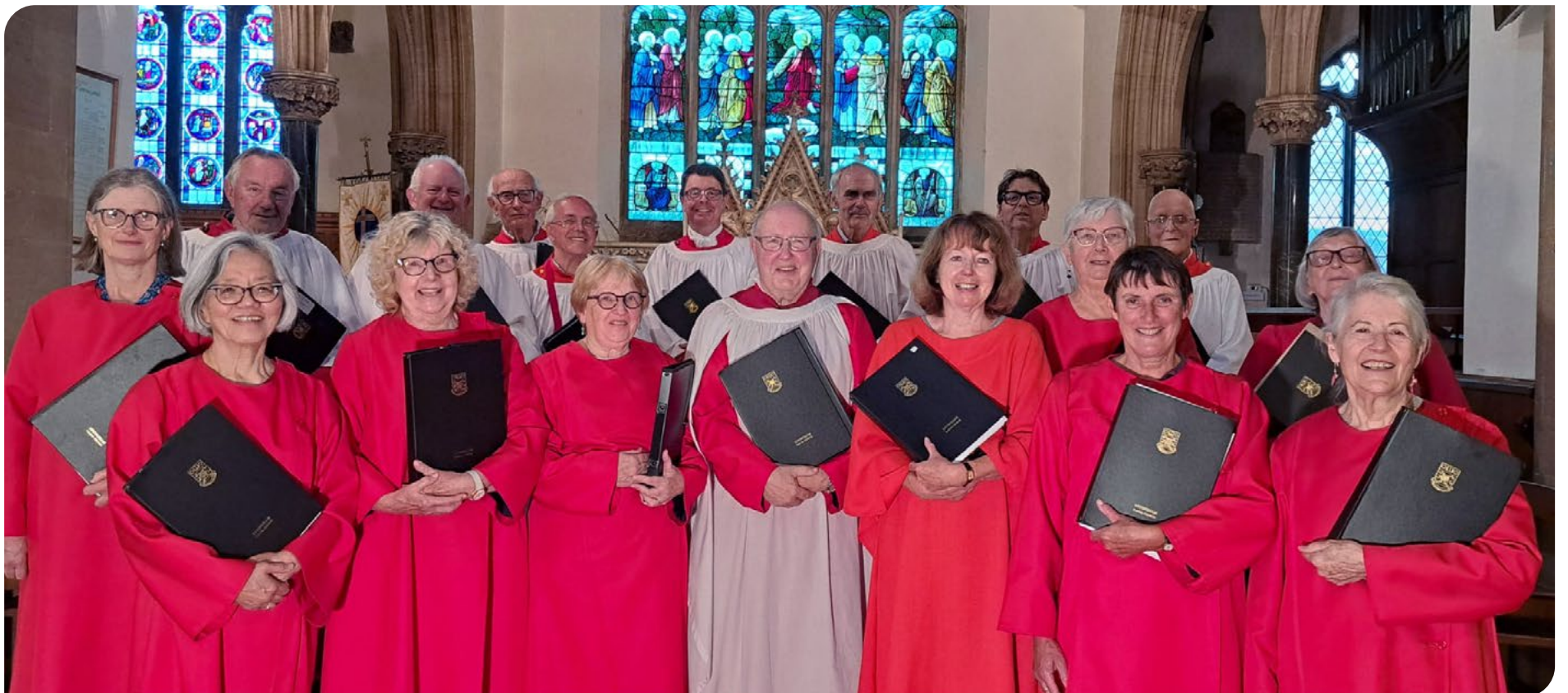
Uppingham Parish Choir