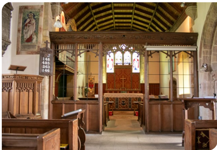
(Left) Chancel of St Peter's, Belton