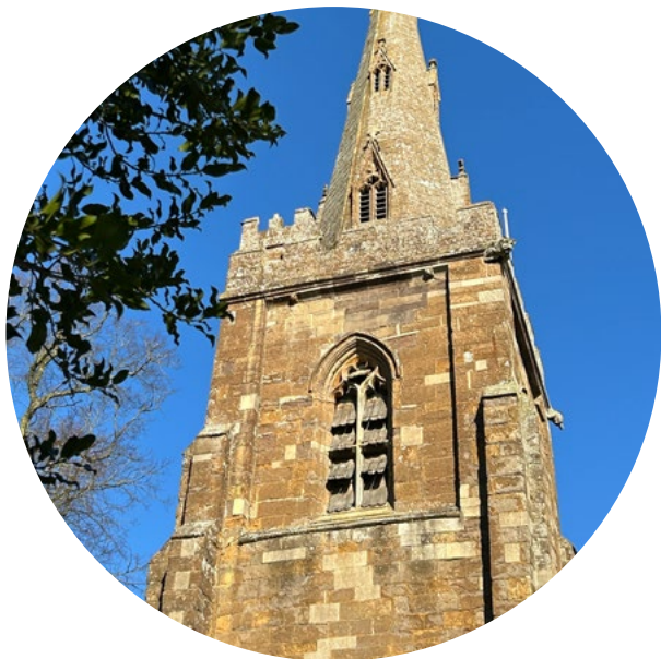
Above; SS Peter & Paul, Uppingham.