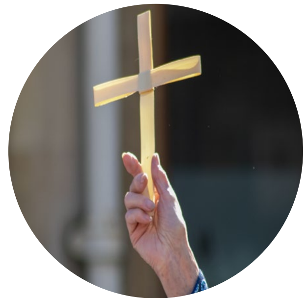
Palm Sunday in Uppingham Market Place