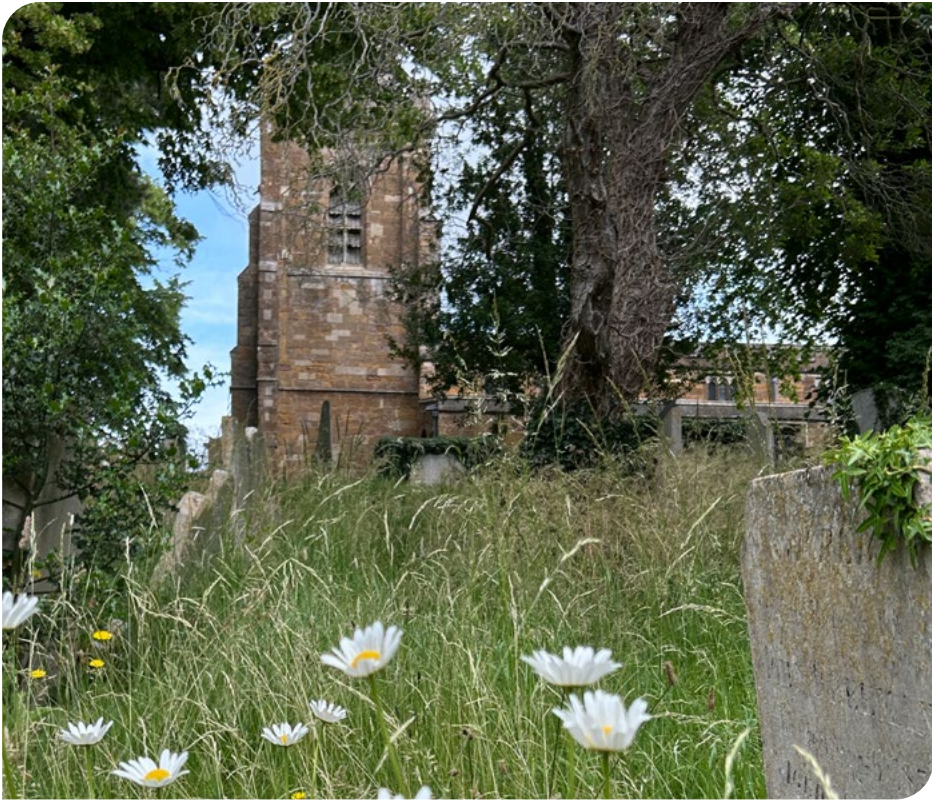
St Peter & St Paul's Uppingham and our Silver Eco Award winning churchyard