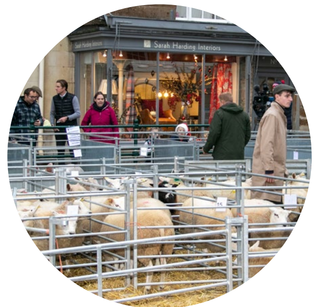
Annual Fat Stock Show in Uppingham Market Place.

We have contact with un-churched families, and hope this could grow and expand, such that they know the church is there for them.