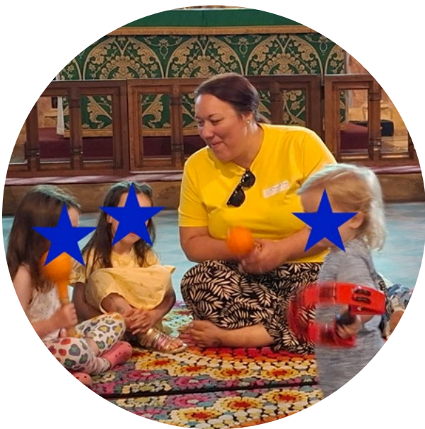
Little Fishes Toddler Group