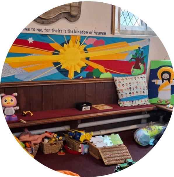
Children's area in SS Peter & Paul's

The diocese is currently in the process of completing the purchase of this property as Uppingham's new Rectory.