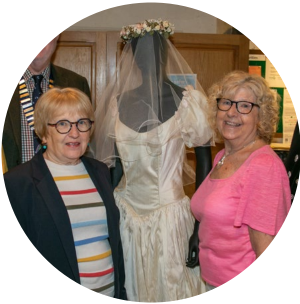
Wedding Dress Festival