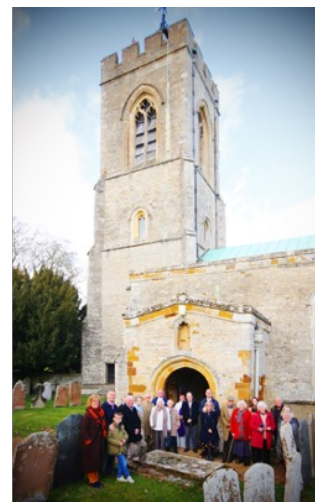
St Mary Magdalene, Castle Ashby