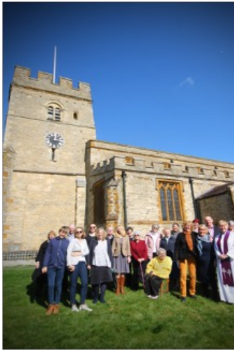
St Andrew's, Yardley Hastings