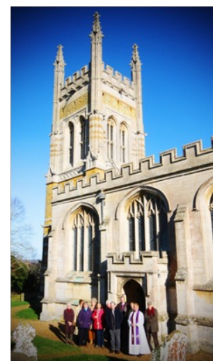
St Mary the Virgin, Whiston

Spreading the love of Christ in our community