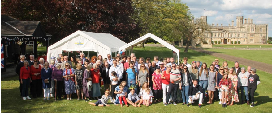
Castle Ashby Villagers at our Coronation Party

Castle Ashby Farm is centred around Home Farm in the village, although the 2,500 acres farmed is spread out across the Estate. The recently renovated Falcon Hotel in the village, has a popular restaurant and “wellness centre”, and offers wild swimming throughout the year, which is very well frequented. Several “Wellness” courses are run during the year and those attending are often brought to a church service. Castle Ashby Gardens attract many visitors to the “Italian Gardens and Arboretum,” together with its café and playground area: many people also visit the church during their trip.