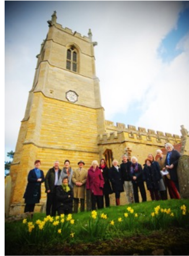
St Mary's, Grendon