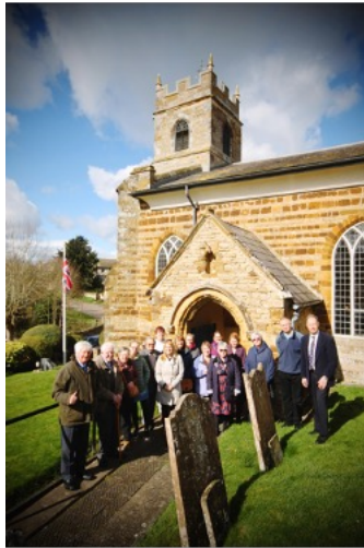
St Margaret's, Denton